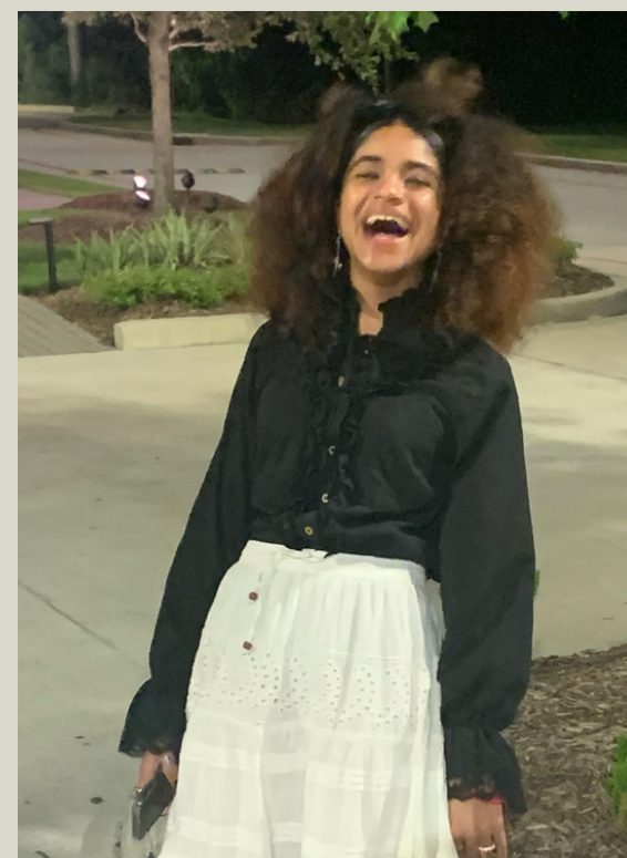
Speech & Debate President Theater Vice President